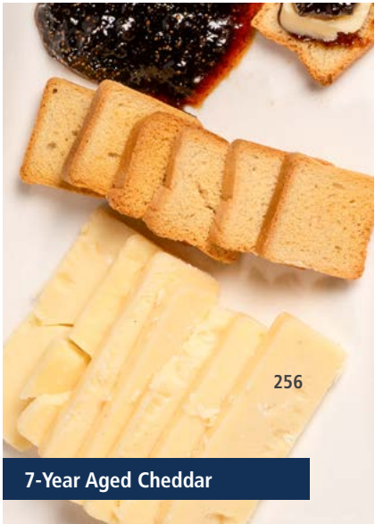
7-Year Aged Cheddar