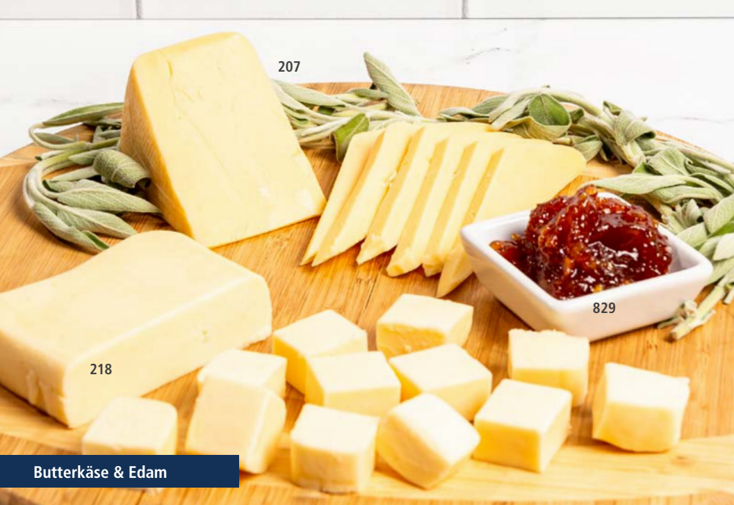
Butterkäse & Edam