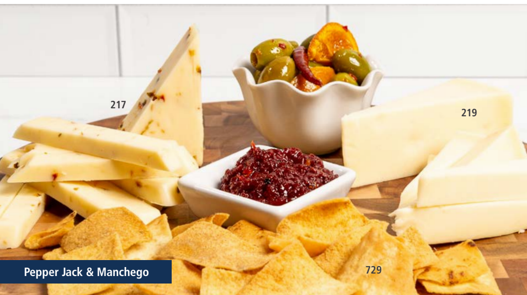
Pepper Jack & Manchego

207 8 oz. EDAM $8 218 8 oz. BUTTERKÄSE $11 217 8 oz. PEPPER JACK $8 219 8 oz. MEXICAN-STYLE MANCHEGO $8 Also Featured: 829 8.5 oz Divina PERUVIAN PEPPER JAM $8 729 7 oz. Miticia SARDINIAN FLATBREAD TOKETTI ROSMARINO $10