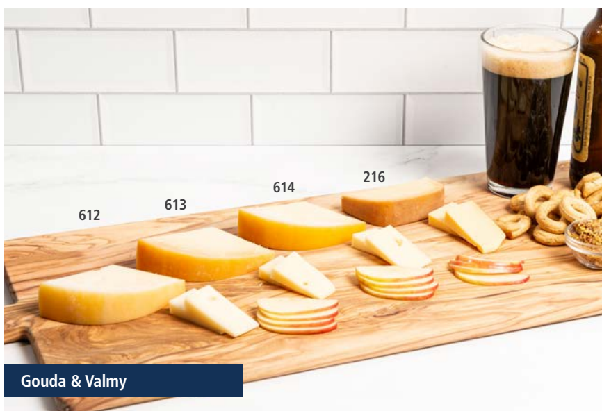
Gouda & Valmy

212 8 oz. BABY SWISS $8 213 8 oz. CREAMY HAVARTI $8 612 5 oz. Frisian Farms AGED GOUDA $9 613 5 oz. Frisian Farms SMOKED GOUDA $8.50 614 5 oz. Frisian Farms YOUNG GOUDA $8.50 216 8 oz. Maytag Dairy Farms VALMY $8.50